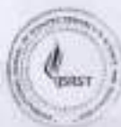
Associate Editor IJSRST